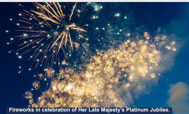
Fireworks in celebration of Her Late Majesty's Platinum Jubilee.

The Town Council offer further room hire discounts to community organisations. To find out more visit https://www.saltash.gov.uk/facilitiesforhire.php