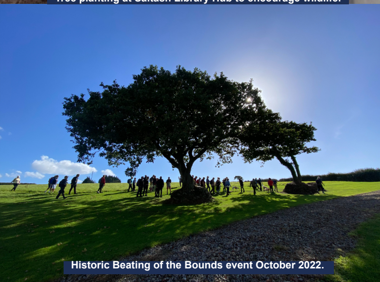
Historic Beating of the Bounds event October 2022.