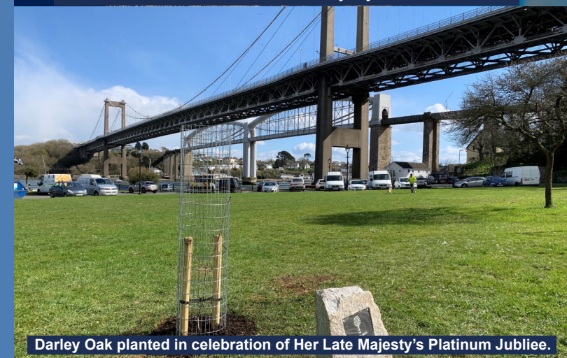
Darley Oak planted in celebration of Her Late Majesty's Platinum Jubilee.