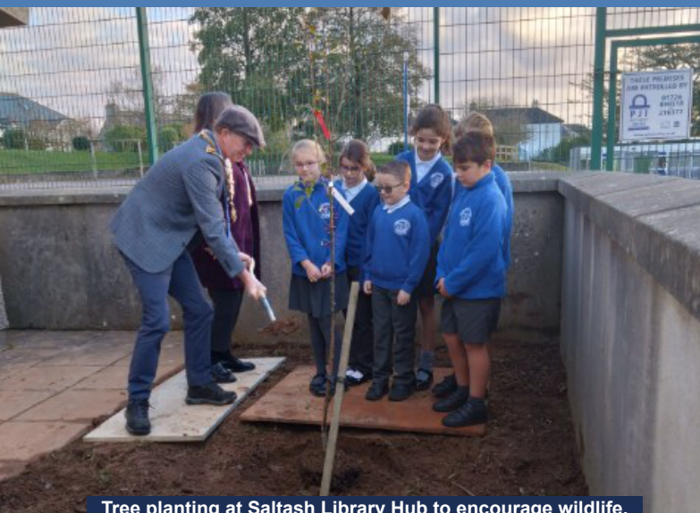
Tree planting at Saltash Library Hub to encourage wildlife.

Did you know your Councillors are on Fore Street for 'Meet your Councillors' every second Saturday of the month outside Bloom Hearing Specialists. Come and give us your views.